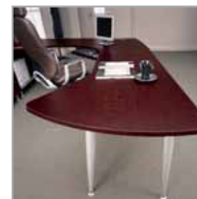
Various worksurface shapes can be used as returns, islands or end end caps (Delta shown above)